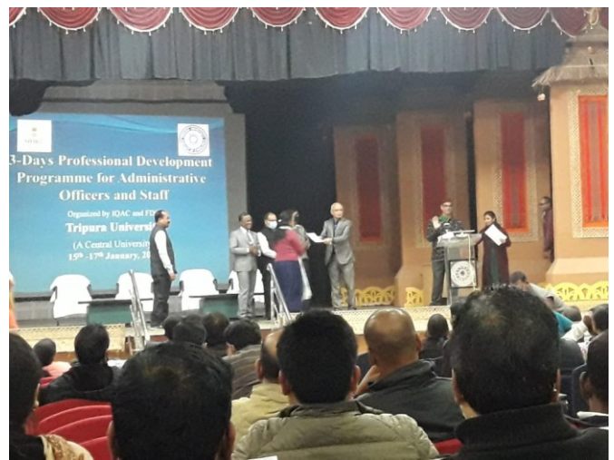
‘Certificate of Participation’ giving ceremony.